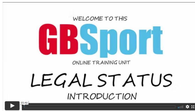
What Is Legal Status & Why It Matters