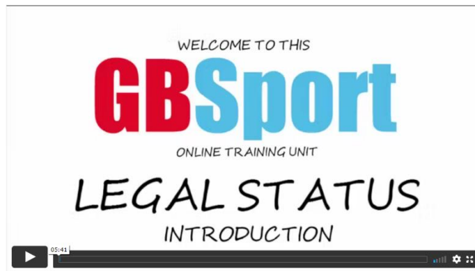
What Is Legal Status & Why It Matters